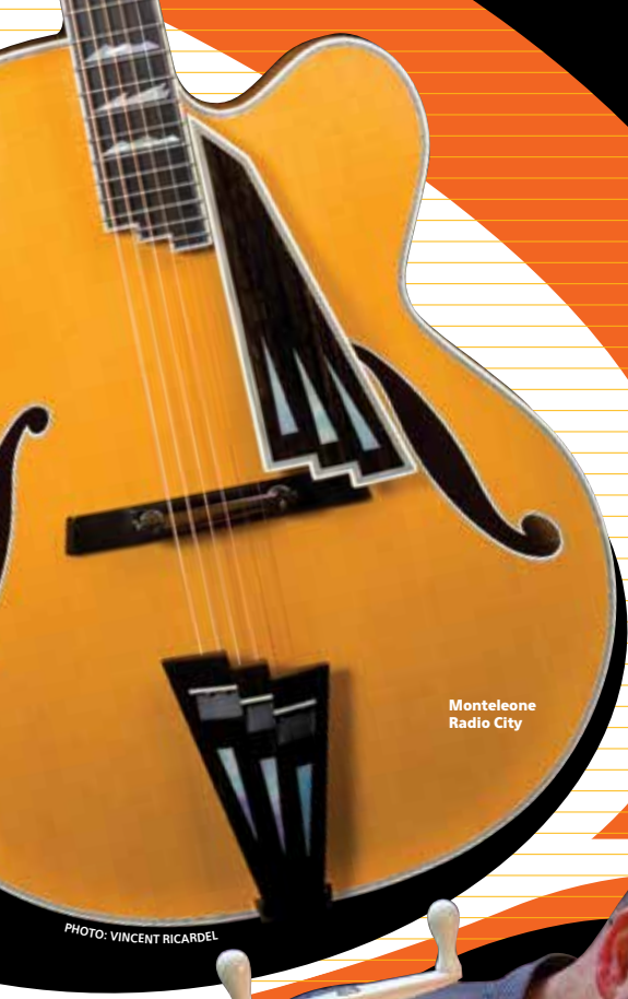
Monteleone Radio City