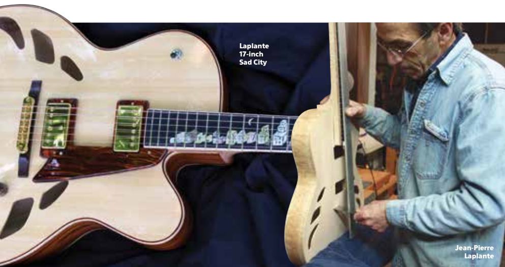
Laplante 17-inch Sad City